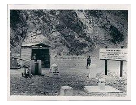
Figure 2; - Border crossing between British India and Afghanistan in 1934.

accessible only by one road. In it there are Musulmáns, and it has a town, in which are infidels from Hind."<sup>[17].</sup> Between the 10th century to the mid 18th century, northern India has been invaded by a number of invaders based in what today is Afghanistan. Among them were the Ghaznavids, Ghurids, Khaljis, Suris, Mughals and Durranis. During these eras, especially during the Mughal period (1526–1858), many Afghans began immigrating to India due to political unrest in their regions.